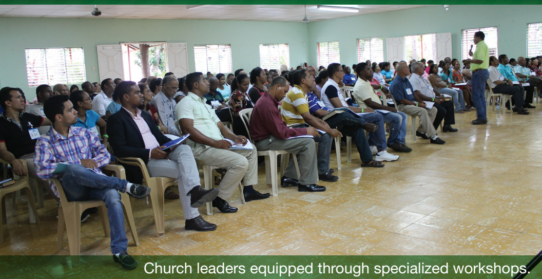
Church leaders equipped through specialized workshops.

Instead of attracting people to a Church building we are equipping and sending the Church into the community.