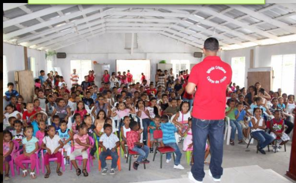
A Vision that brings hope to Las Guaranas