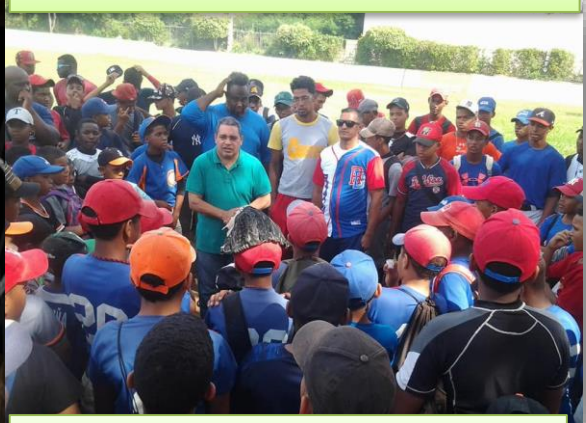
Partnering with the local church to meet a need in its community!