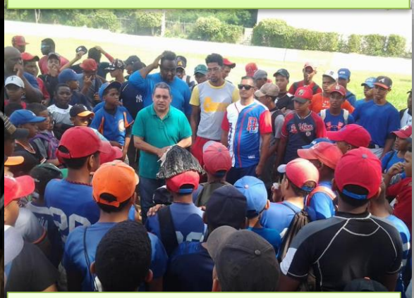
Partnering with the local church to meet a need in its community!