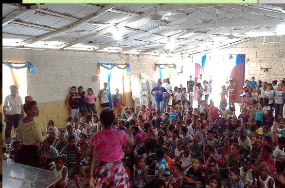
A Vision that brings hope to Hato Mayor