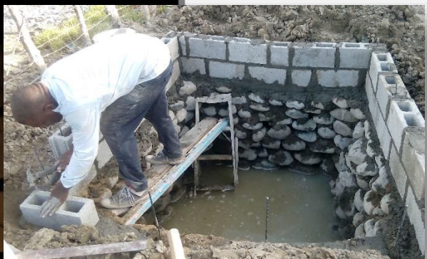
A Vision that brings hope to Palmar de Ocoa