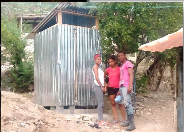
Partnering with the local church to meet a need in its community!