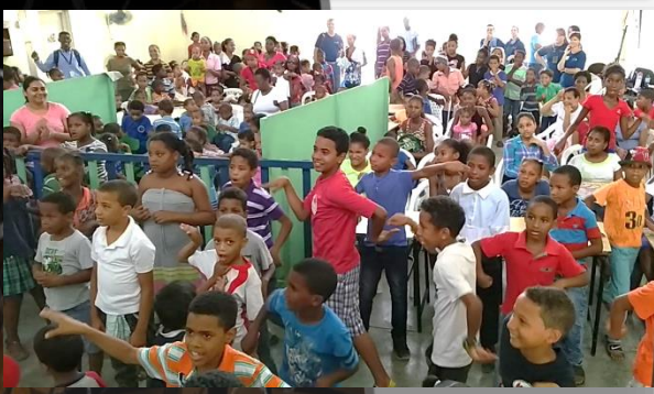
Partnering with the local church to reach its community!

If you are interested in coming on a Missions Trip with LoveServes: