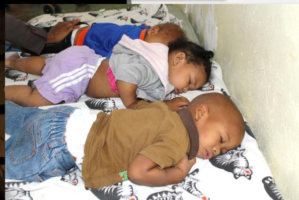
A Vision bringing hope to Los Tamarindos