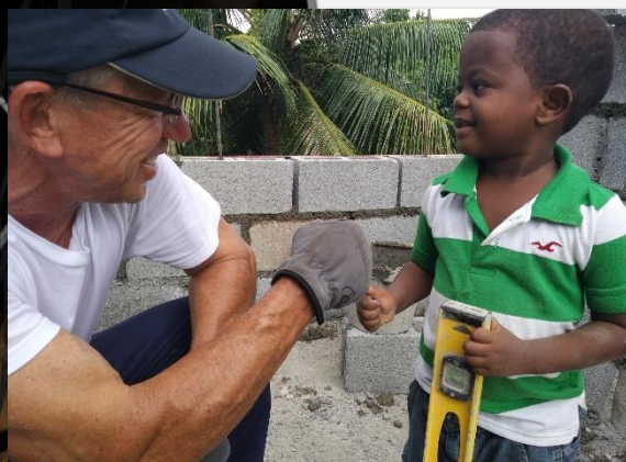
Partner with a church reaching its community