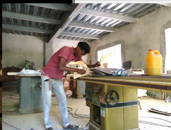
A Vision that brings hope to Haina